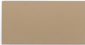
Mocha Tan (22)