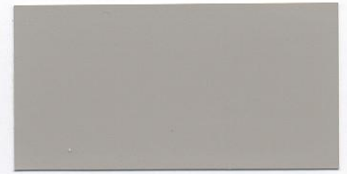
Ash Grey (25)