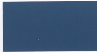
Ocean Blue (35)